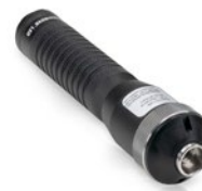
SuperNova LED hand light source