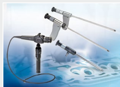
Industrial endoscopes, light sources