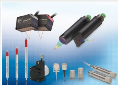
Sensors and systems for displacement, distance and position