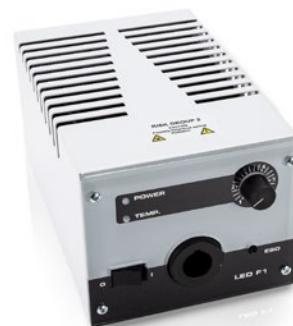
FOT LED without fan

*depending on the ambient temperature, room humidity and the intensity set