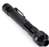
LED hand-held light source