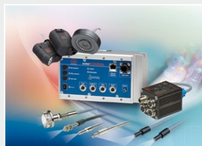
Color recognition sensors, LED analyzers and inline color spectrometers