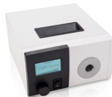
FOT LED 3000 / 5100