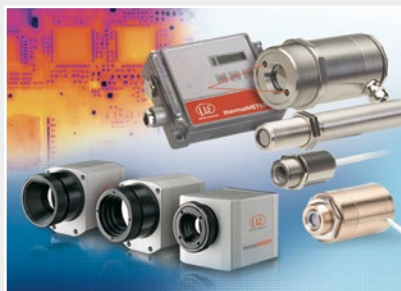
Sensors and measurement devices for non-contact temperature measurement