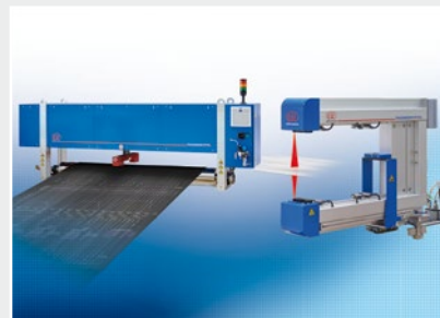
Measuring and inspection systems for metal strips, plastics and rubber