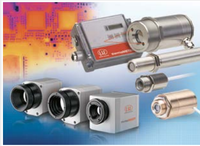
Sensors and measurement devices for non-contact temperature measurement