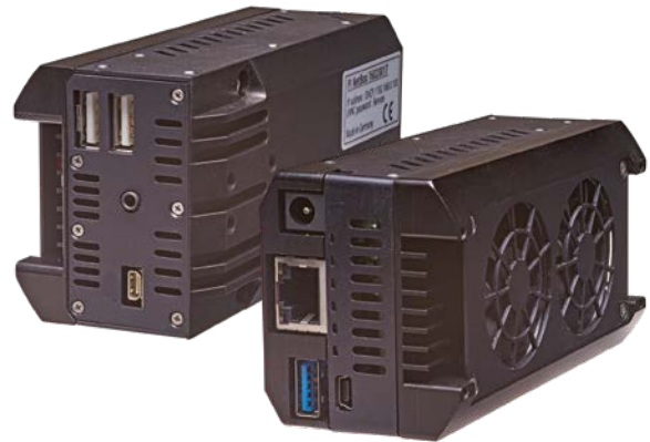
thermoIMAGER TIM NetBox